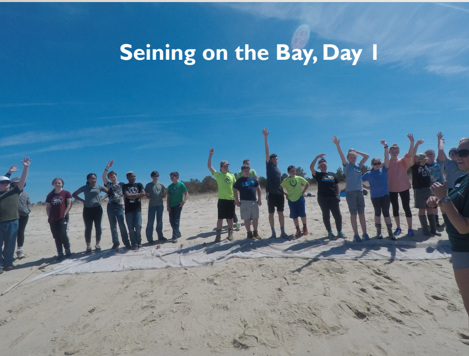
Seining on the Bay, Day 1